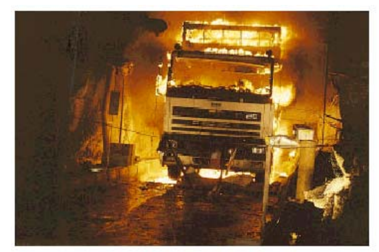
Figure 3: Fire test on a heavy good vehicle loaded with 2 t of modern furniture

3. The size of the fires has been recalculated on the basis of the Swedish and Norwegian measurement of heat release. The fire of a single private car resulted to a value of 3 to 5MW. The bus and rail car fires mostly amounted to between 15 and 20 MW, the burning of the heavy good vehicle was measured more than 100 MW. This leads to the values given in Table 2.