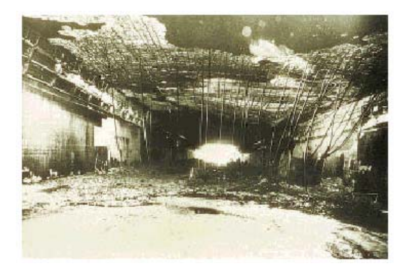
Figure 1: Completely destroyed pre-stressed concrete roof following a lorry fire in the Moorfleet/Hamburg motorway tunnel in 1968

Fire in traffic tunnels, are an international problem. They are characterized by the danger they resent to the persons affected and, in many cases by the considerable amount of material damage that they cause (see Fig. 1). Serious accidents in road tunnels resulting in fatalities and injuries have been individually reported from Austria, France, Japan, and the U.S.A. The most recent fire accidents have been the catastrophes in the Mont Blanc Tunnel between France and Italy on March 24, 1999 and in the Tauern Tunnel in Austria on May 29, 1999 with 41 and 12 fatalities respectively. Various major fire accidents have also occurred in tunnel facilities in Germany. These cases have served to draw attention to the possibilities of escape and rescue, which are made more difficult in a tunnel scenario.