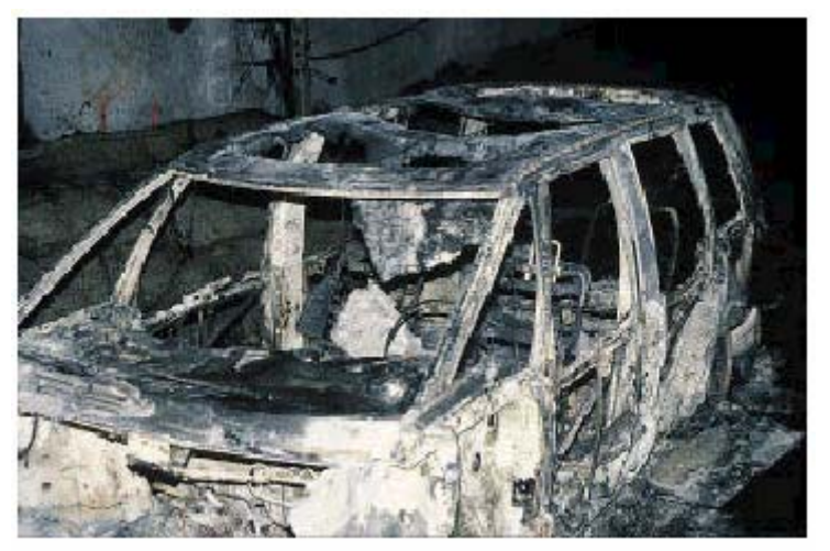
Figure 2: Plastic car Renault Espace completely burnt down in a fire test within the EUREKA project EU 499.

1. The influence of damage both to the vehicles and the tunnel lining, especially in the crown area, depends on the type of car. This fact, already derived from numerous fire accidents was entirely confirmed by the tests in Norway. The roof of those vehicles constructed of steel resisted the heat, whereas the roofs of the public bus and of a metro car both made of aluminium were completely destroyed at a rather early stage of the test fire. The same happened, as expected, to the roof of the private car with a plastic body (see Fig. 2).