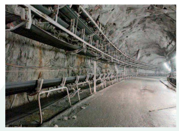
Lötschberg Base Tunnel Switzerland, adit of Ferden during construction

It is recommended to have an adaptable market for the adit construction, in particular if the survey function is essential.